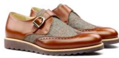
SINGLE MONK STRAP