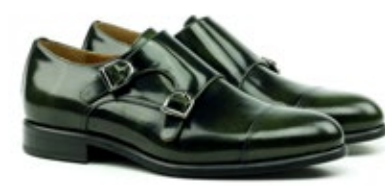
DOUBLE MONK STRAP