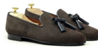
SUEDE DINNER LOAFERS