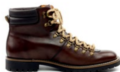
HIKER STYLE BOOTS